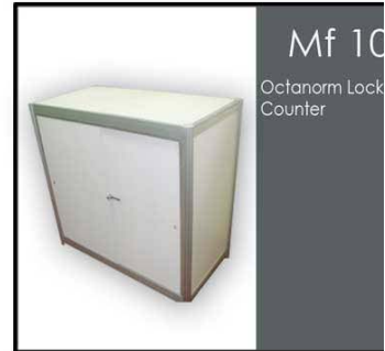
Mf 10 Octanorm Lock Counter