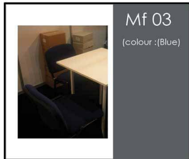
Mf 03 (colour :(Blue)