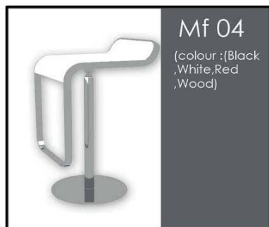
Mf 04 (colour :(Black ,White,Red ,Wood)