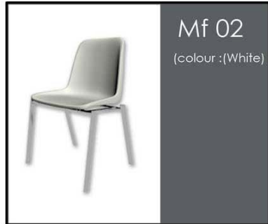
Mf 02 (colour :(White)