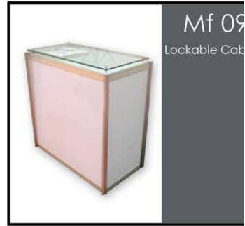
Mf 09 Lockable Cab