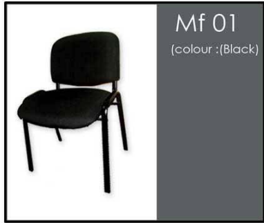
Mf 01 (colour :(Black)