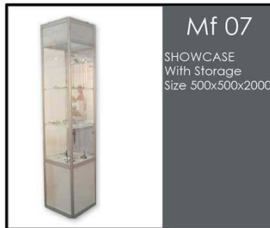
Mf 07 SHOWCASE With Storage Size 500x500x2000