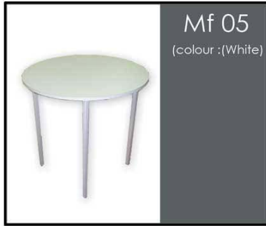
Mf 05 (colour :(White)