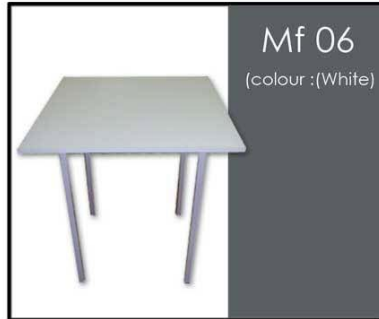
Mf 06 (colour :(White)