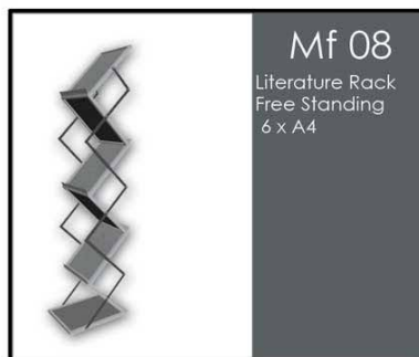
Mf 08 Literature Rack Free Standing 6 x A4